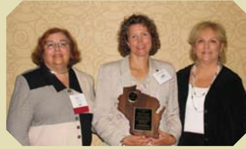
Wheaton Franciscan Healthcare- Elmbrook Memorial Auxiliary