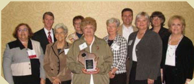
Mercy Medical Center Auxiliary, Oshkosh