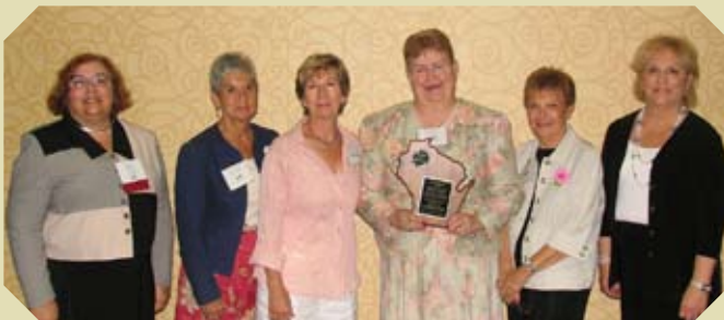
Mercy Health System Association of Volunteers, Janesville