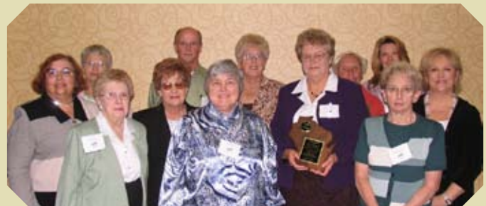
Partners of St. Nicholas Hospital, Sheboygan