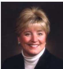
Sen. Carol Roessler

“As consumer driven health care becomes increasingly more popular and necessary, health care cost transparency has become a critical component in empowering consumers to make educated decisions. Through their new ‘PricePoint’ Web site, the Wisconsin Hospital Association has successfully compiled and organized hospital charge data in a way that is easy to understand and is readily available to anyone interested in comparing hospital charges across the state. This represents a significant step in allowing Wisconsin health care consumers to ‘comparative shop’ for health care.”