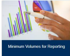
Minimum Volumes for Reporting