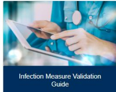
Infection Measure Validation Guide