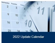
2022 Update Calendar