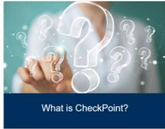
What is CheckPoint?