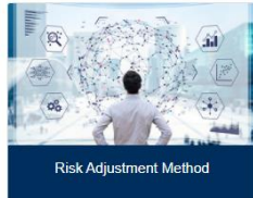
Risk Adjustment Method