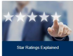
Star Ratings Explained