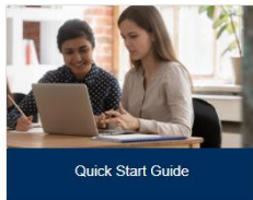
Quick Start Guide