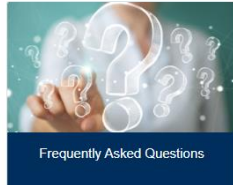
Frequently Asked Questions