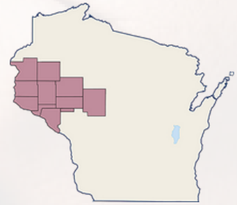
West Central $103,989,429