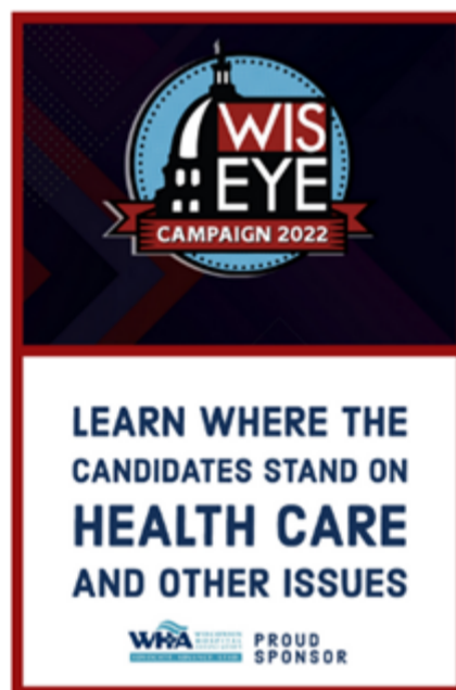
About the Candidates