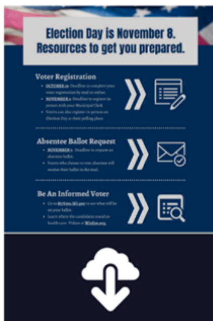
Download Poster (Portrait)