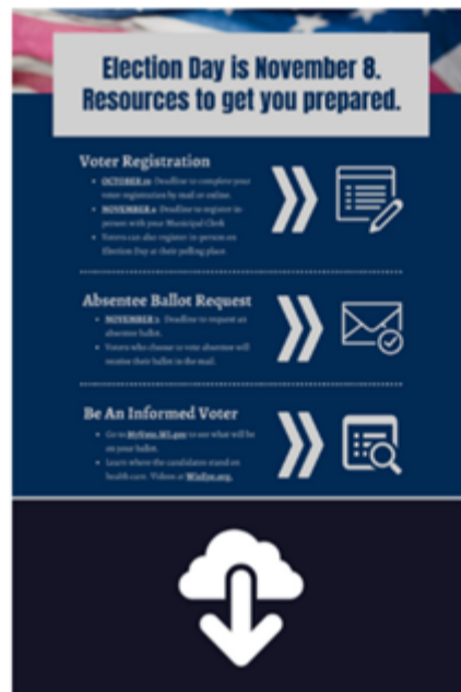
Download Poster (Portrait)