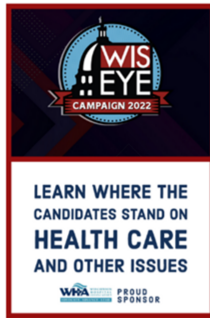
About the Candidates